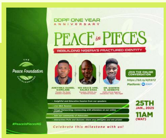
Peace in Pieces: Rebuilding Nigeria's Fractured Identity