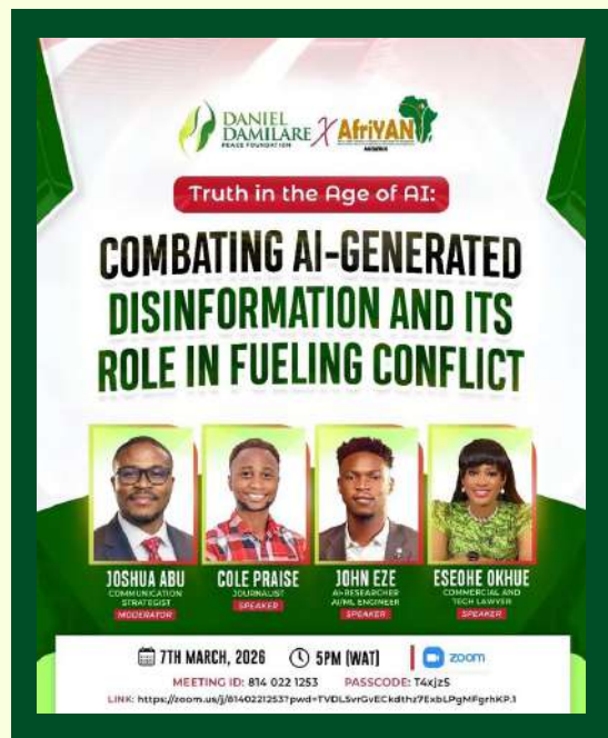
Truth in the Age of AI: Combating AI-Generated Disinformation and Its Role in Fueling Conflict.