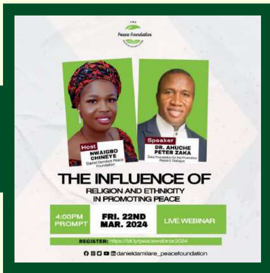
The Influence of Religion and Ethnicity in Promoting Peace