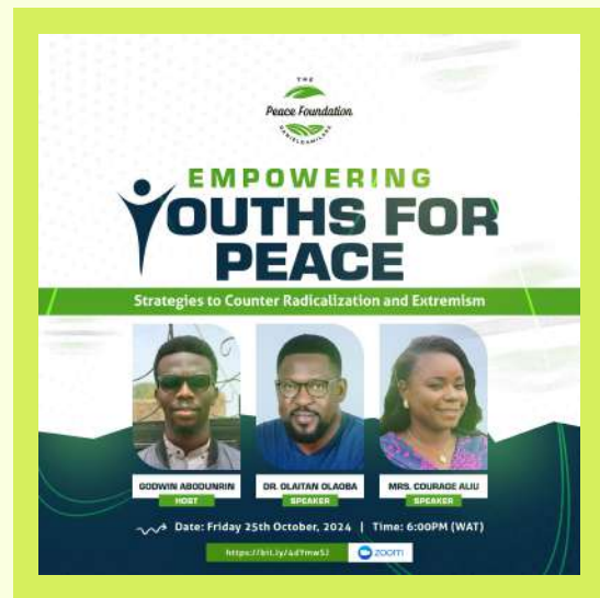
Empowering Youths for Peace: Strategies to Counter Radicalization and Extremism.