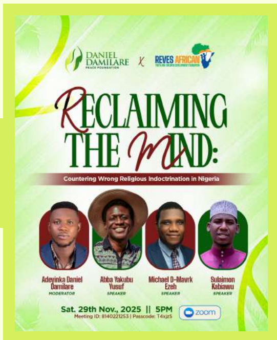
Reclaiming the Mind: Countering Wrong Religious Indoctrination in Nigeria