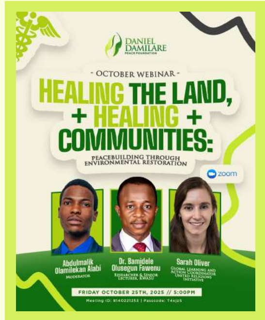
Healing the Land, Healing Communities: Peacebuilding through Environmental Restoration